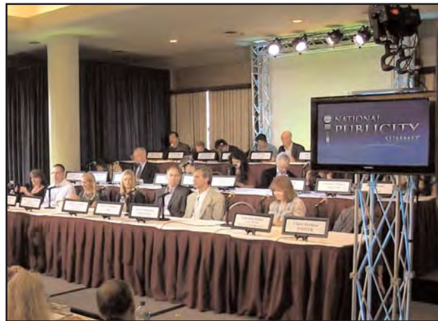
At the National Publicity Summit, you'll have the chance to meet top editors & producers from leading media outlets

When I noticed how much meeting the media personally had helped my clients, I created a fun, one-of-a-kind event in New York City where you don't have to chase them.